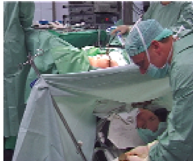
Figure 3. Intraoperative demonstration of the findings to the patient.