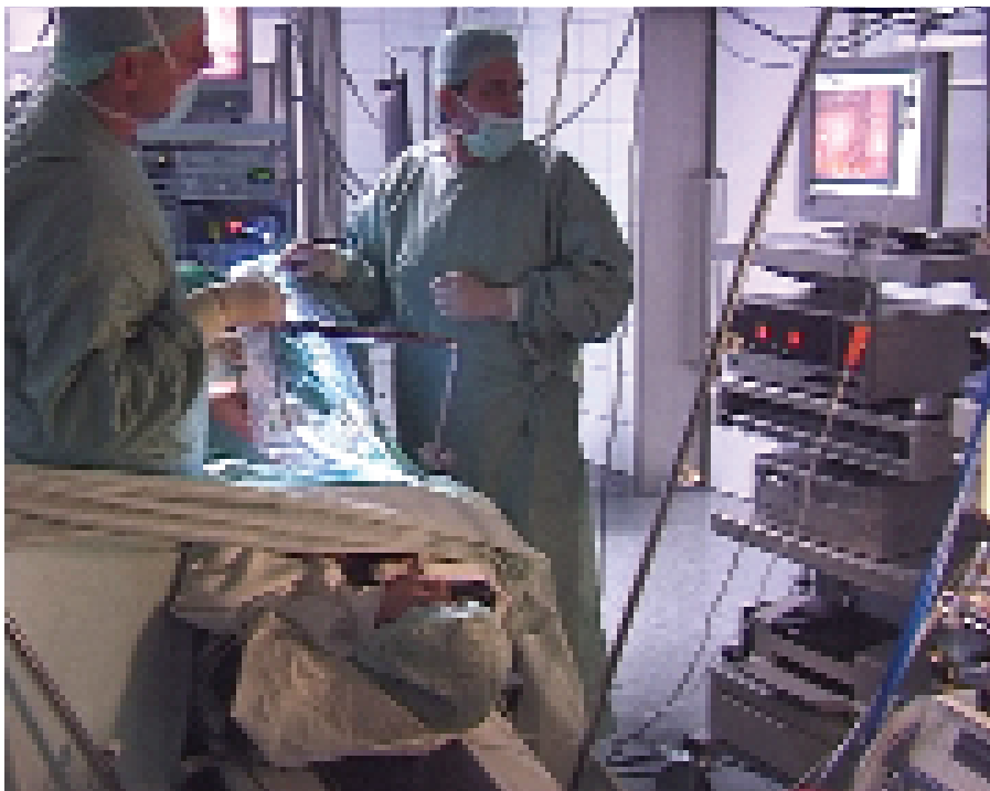
Figure 1. Intraoperative findings are demonstrated to the patient.

All operations were performed successfully without converting to general anesthesia or other forms of anesthesia, and without operative or anesthesiologic complications. Three patients complained of mild shoulder pain during the operation, and was treated with piritramide. The head-down position was well-tolerated by all patients, and in no case were respiratory problems encountered. The mean duration of surgery was 47 (range: 35-65) minutes for adnexal surgery and 71 (range: 55-112) minutes for myoma enucleation. None of the patients complained of postoperative vomiting, nausea, or both. Pain intensity measured three hours after surgery was mild, and only four patients requested a painkiller. In general, mild postoperative shoulder or upper abdominal pain persisted for 12 to 24 hours, and none of the patients com-